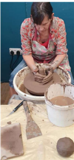
What a messy job!